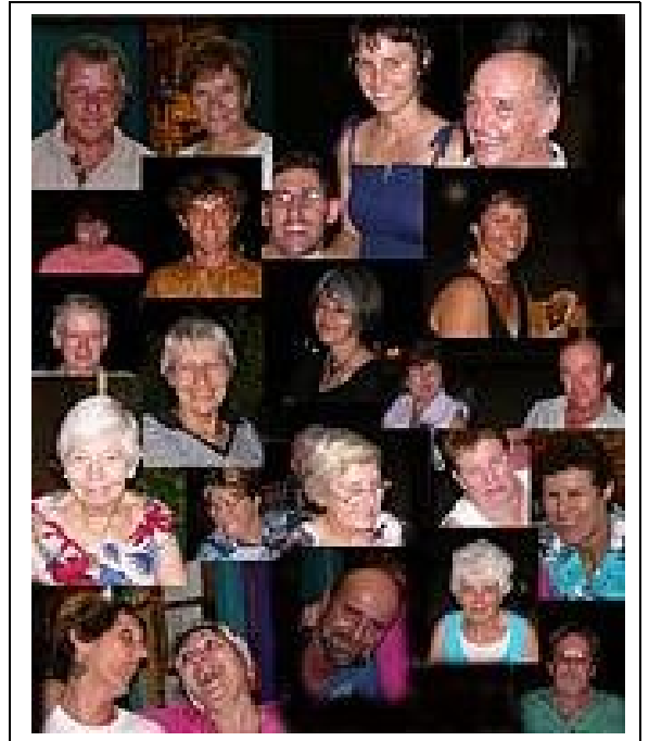
Below Many of the faces from 2001-2004

All our members and volunteers who have helped fundraise, thru cake stalls and raffles over the years have not only helped to keep us stay financially stable but also have allowed us to keep a nest-egg of funding for this move which we knew we would eventually have to make to a new site.